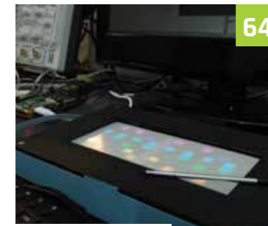
Tap-an-LED part 2