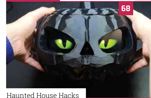
Haunted House Hacks